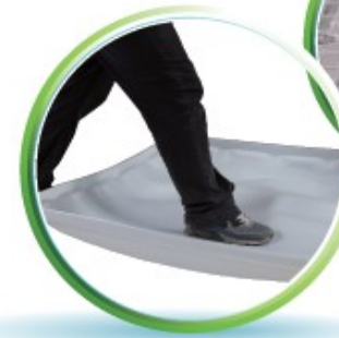
Wave roof design and easy moving

The portable toilet non-flush design is ideal for building. High quality and special price are super value what you choice. We develop, produce a rapid process to supply a large quantity.