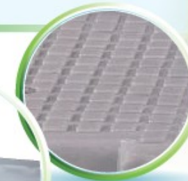
Tofu design for easy clean